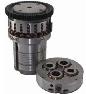
XMTE4 Multi Tool Punch Holder Assembly available exclusively from Euromac